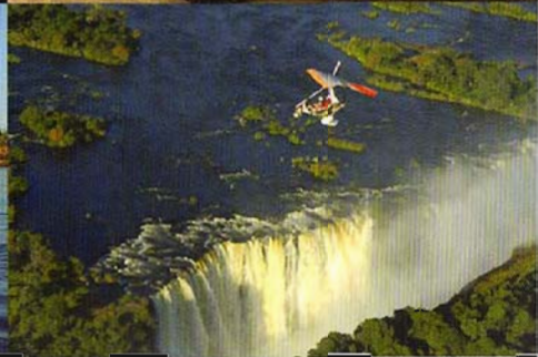
Stanley Safari Lodge Livingstone • the Victoria Falls • Zambia